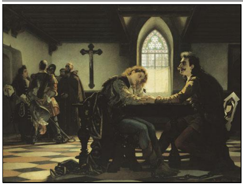
Figure 2 Viktor Madarász. Péter Zrínyi and Ferenc Frangepán in Prison at Wiener-Neustadt (1864). Oil on canvas, 177 x 234 cm.