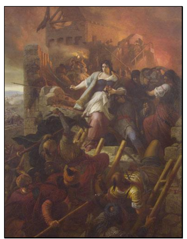
Figure 3 Bertalan Székely. The Women of Eger (1867). Oil on canvas, 227 x 176.5 cm.