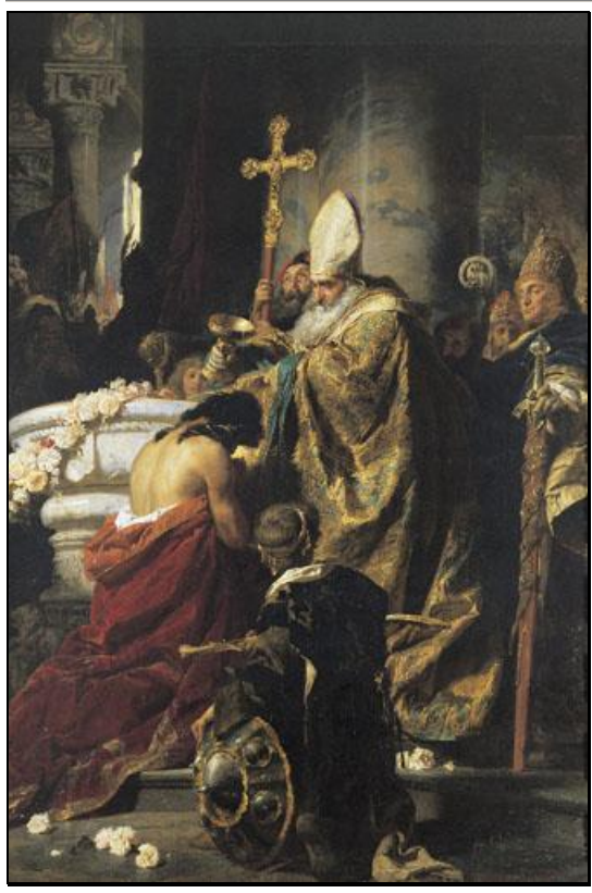
Figure 4 Gyula Benczúr. The Baptism of Vajk (1875).

Oil on canvas, 358 x 247 cm.