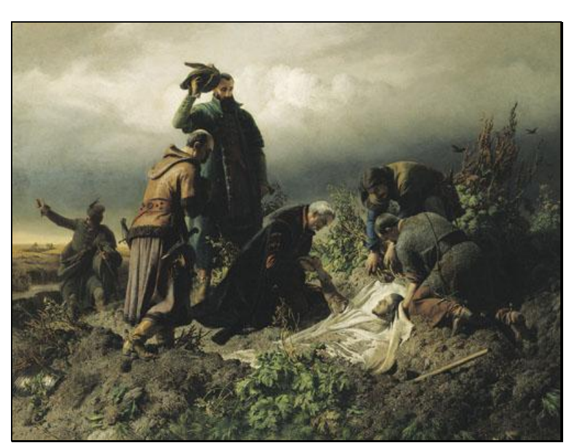
Figure 1 Bertalan Székely. The Discovery of the Body of King Louis II (1860). Oil on canvas, 140 x 184 cm.