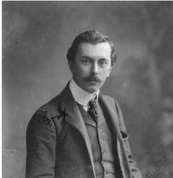
Count Miklós Bánffy de Losoncz