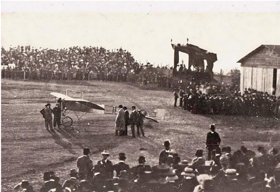
Blériot's first flight over Vérmező ['Blood Fields'] on October 17, 1909