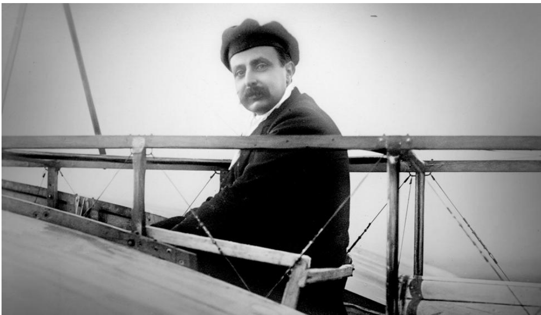
Louis J. Ch. Blériot (1872-1936) before the 1909 English Channel crossing