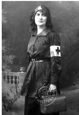
Karola Szilvássy during the First World War