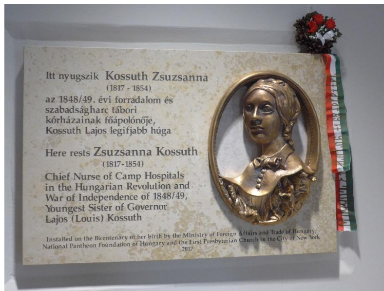
Memorial plaque at First Presbyterian Church, New York