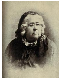
Elizabeth Palmer Peabody