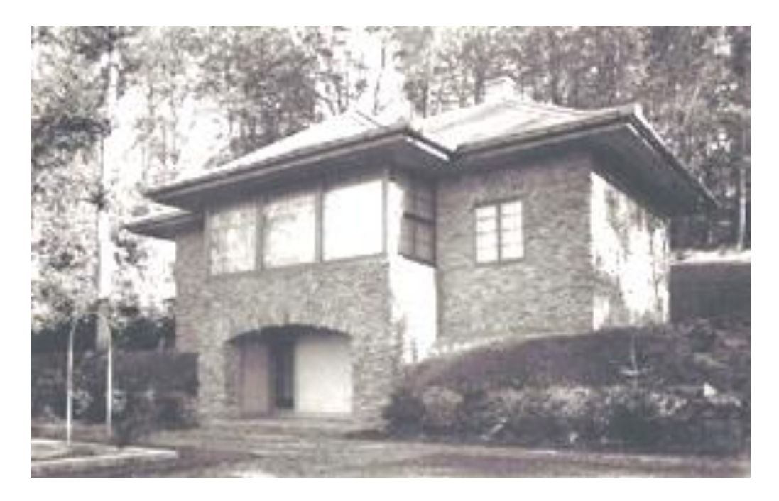
Fig. 4. Cécile Tormay's villa, the Meseház in Mátrafüred

['Kevesen tudnak a szegénységen művészettel segíteni. Kevesen tudják ízléssel pótolni azt, ami életükben egyszer földi javakból volt és onnan önhibájukon kívül kiesett. Tormay Céciléről sohasem tudta meg senki, milyen nehezen élt. Háza mindenki számára nyitva volt és a múlt kultúrája és tradíciói megvívták az életszínvonal megtartásáért folytatott küzdelmüket. Ahogy ő egy öreg, sok mosástól fényes abroszt elsimított, olcsó kis fenyőgallyat pár szál hóvirággal egy régi kristálypohárba tett, ahogy a megkopott olasz brokátra, hogy fedje, nagyobb könyvet helyezett, akár egyedül, akár több vendéggel volt, szép ezüstjével egyformán teríttetett, az művészet volt, amiről lemondani nem akart és nem tudott'] (Ambrózy Migazzi 1939: 295-296).