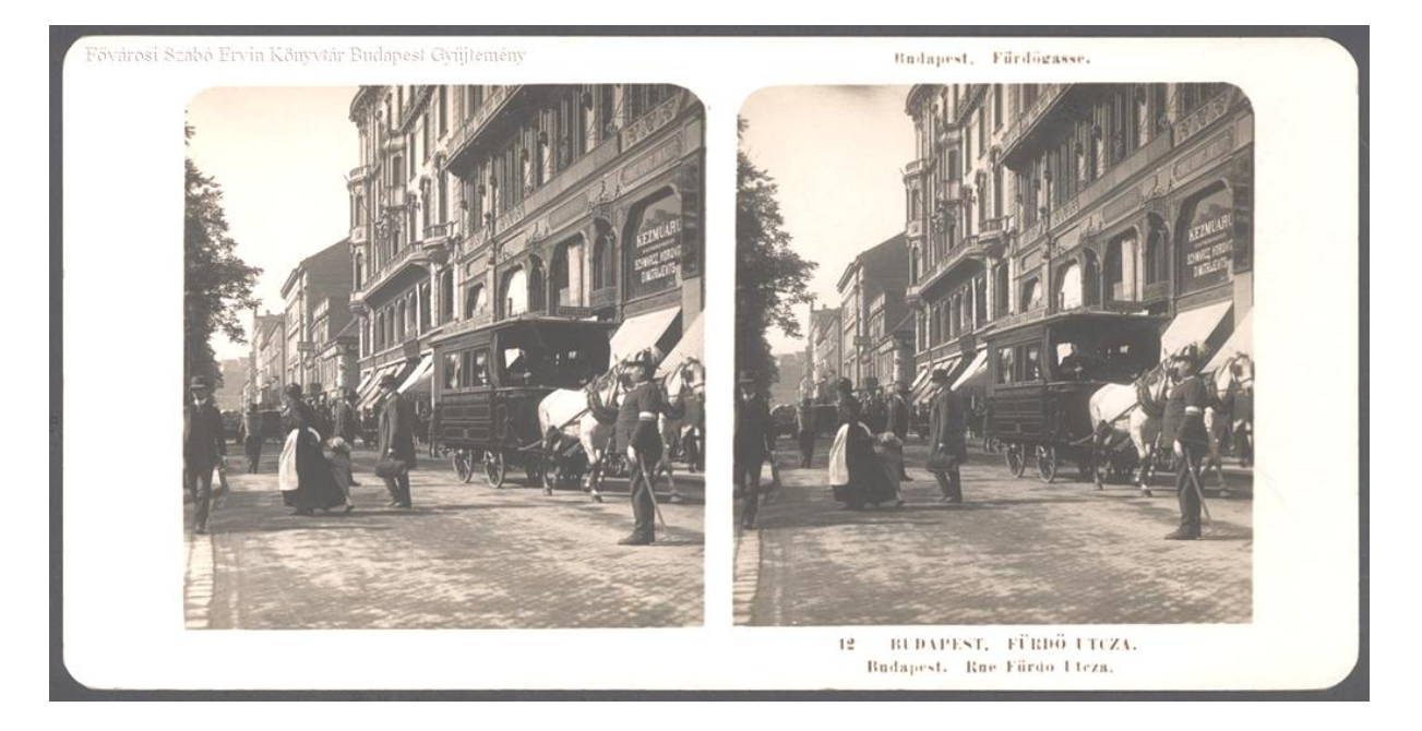
Fig. 2. Fürdő [now: József Attila] Street, Budapest, 1906. Cécile Tormay spent her youth in a house that stood at the end of the right side of the street and faced the Danube