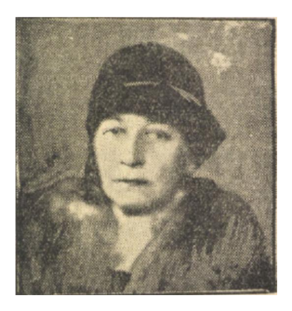
Fig. 7. Cécile Tormay, new member of the International Committee on Intellectual Cooperation of the League of Nations ( Friss Újság ['Fresh Newspaper'], 23 May 1935: 10)

Tormay was not only savvy when it came to alluding to the financial background of the counter-revolution (presumably provided at least in part by the Catholic Church) or the names of counter-revolutionary participants, but she also acted cautiously when discussing Hungary's future form of state, an issue that was called királykérdés ['the royal question']. According to historians, the end of the monarchy as a form of state did not emerge as a traumatic element of Hungary's past during the decades after World War II, a factor that rendered the republican form of government permanent. As Gergely Romsics states in his analysis of memoirs discussing the collapse of the Austro-Hungarian Monarchy: "Due to the primacy of a Hungarian identity that remained independent of the Empire—or at least considering itself independent—the Aster Revolution, the Soviet Republic and Trianon Peace Treaty became the primary sources of twentieth-century Hungarian myths. The revolutions and the peace treaty have traumatized society much more than the dissolution of the Monarchy" (2005: 109).