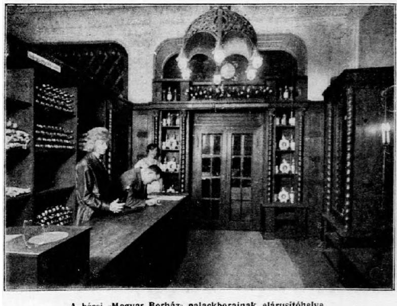
A bécsi «Magyar Borház» palackborainak elárusítóhelye.